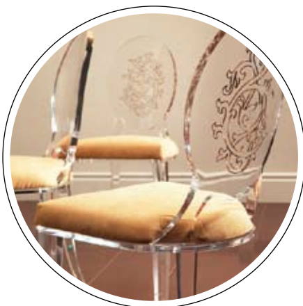
Acrylic framed chairs

Home décor seems to be about simplicity, so some trendsetters say. Because of this, natural