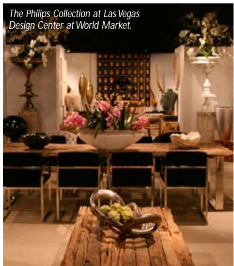
The Phillips Collection at Las Vegas Design Center at World Market.

linens, textiles, and more artistic natural furnishings were shown in the Phillips Collection and the Four Hand Showroom. Mixing elements of style was also very hot this year. Manufacturers showed contemporary acrylic framed chairs with a more traditional velvet fabric and a chrome table base with a rustic wood top. Overall we found so much interest and imagination this year.